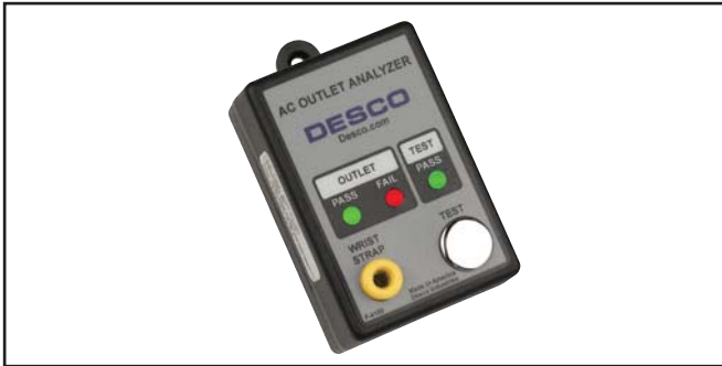
Figure 1. Desco 98130 AC Outlet Analyzer and Wrist Strap Tester