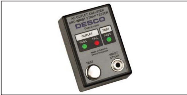
Figure 2. Desco 98131 AC Outlet Analyzer and Wrist Strap Tester